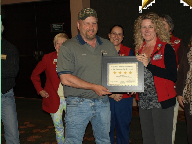
Berger's Top Service Body Shop