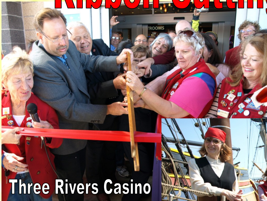
Three Rivers Casino