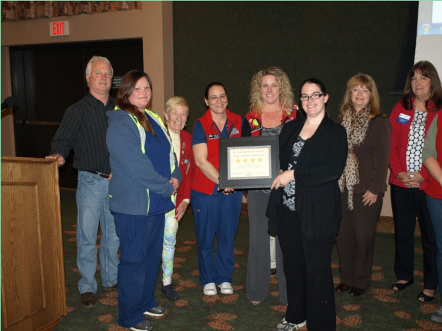
Ocean Boulevard Veterinary Hospital