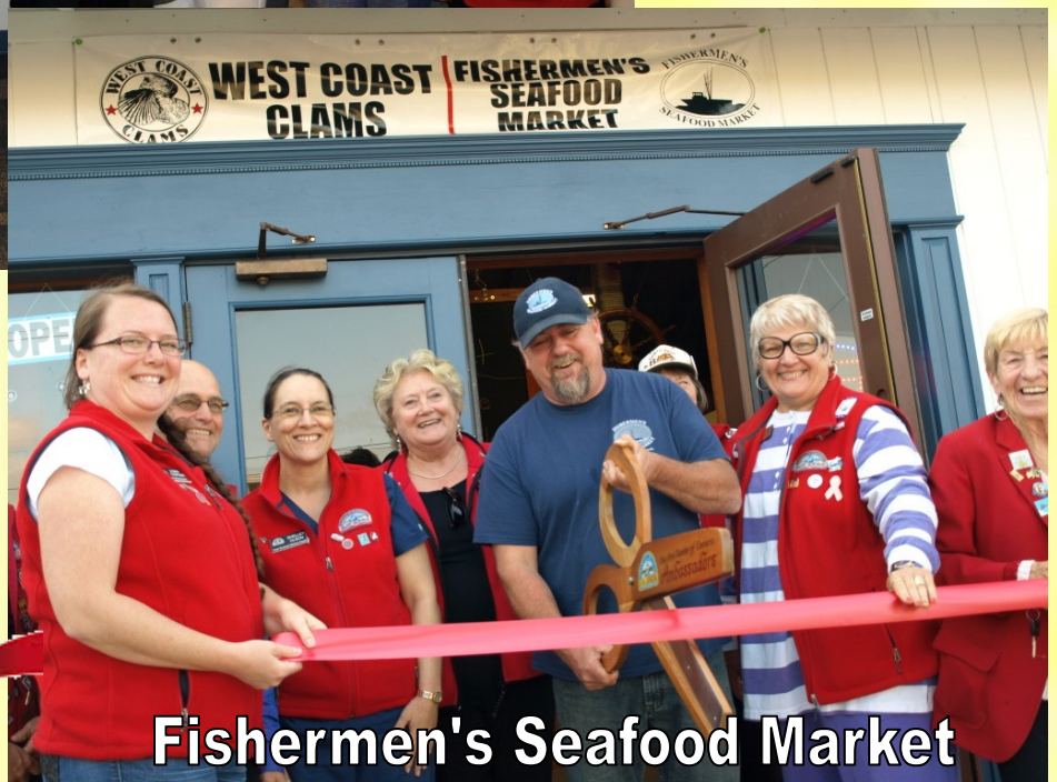
Fishermen's Seafood Market