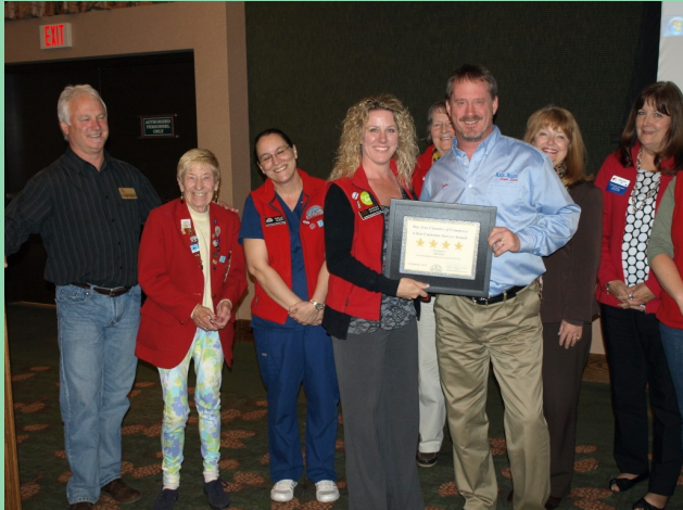
Ken ware Superstore