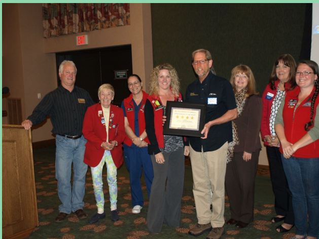
Alternative Actions Massage Therapy