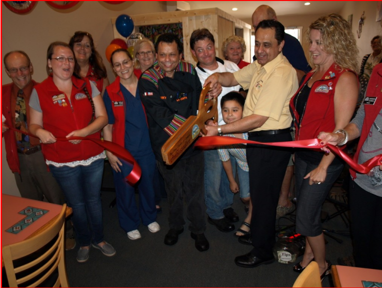
We helped celebrate La Costa's 9 year Anniversary and their expansion of the restaurant, a beautiful new banquet room. Thank you for asking us to be apart of this special day and thank you to everyone who made it.