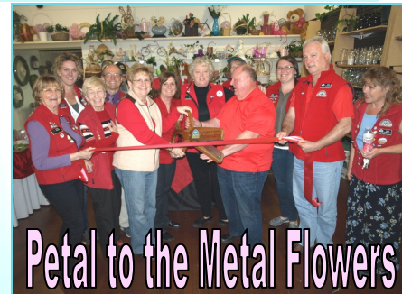
Petal to the Metal Flowers