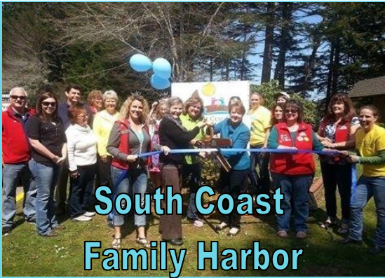
South Coast Family Harbor