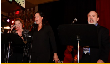
The Chamber Pots