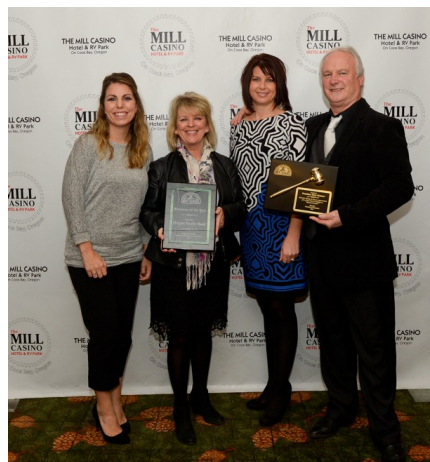
Business of the Year Oregon Pacific Bank