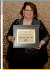
Coos Bay Lions Club