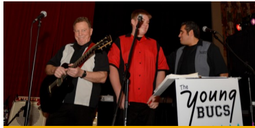
The young Bucs