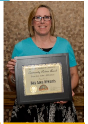
Bay Area Kiwanis